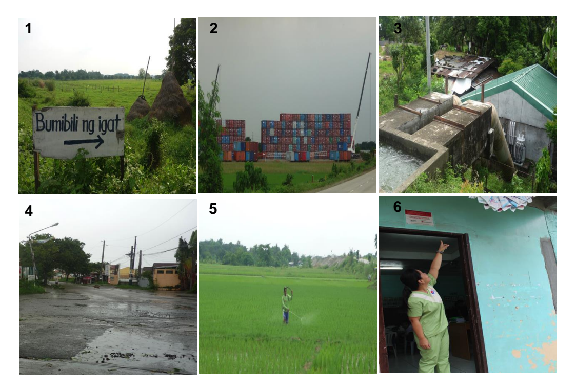
Figure 2: Socio-environmental change in the Angat River Basin. 1: Rice-eel shop indicating a growing number of invasive Monopterus albus . 2: Shipment yard symbolic of regional urbanization and industrialization. 3: Deteriorated irrigation pumps cited as one failure of variable irrigation access. 4: Aftermath of a typhoon. 5: Application of pesticides, a key factor in unsustainable land-use practice. 6: The height of local flooding and the effects on barangays.